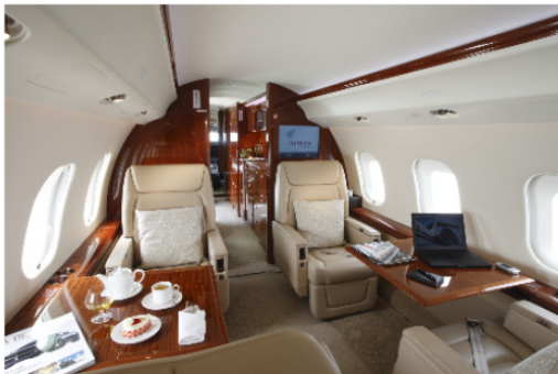
FWD cabin club seating (looking fwd)