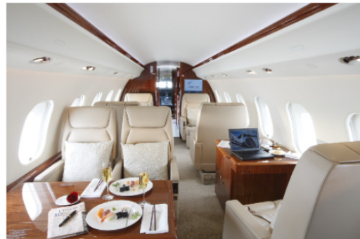
MID cabin conference group (looking fwd)