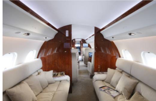
AFT cabin (looking fwd)