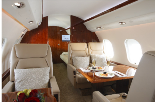
Mid cabin conference group (looking aft)