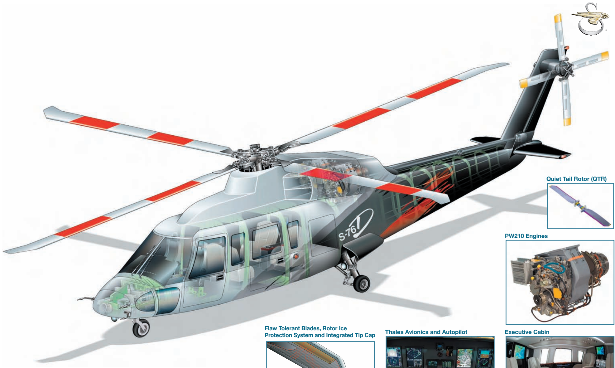
Quiet Tail Rotor (QTR)